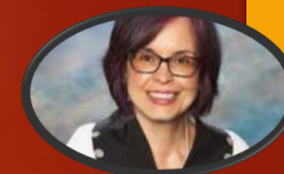
Kāshā ushyeh Land Acknowledgement: Hazelton